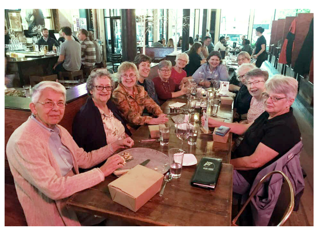
Women's Networking Group gathered at Dark Horse in September.