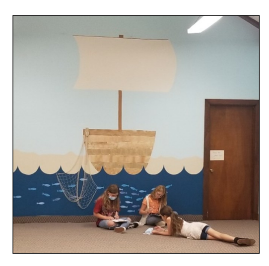
{\it LifeBoat\ small\ group\ break-out.}

The olive tree that is growing in the Galilee Room doubled as the tree in the Garden of Eden during a recent lesson about Adam and Eve.