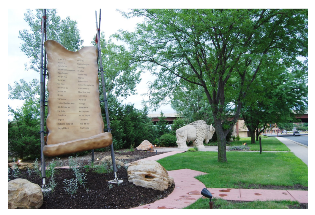
Reconciliation Park, Mankato, MN

It was under these conditions that some Dakota leaders, acting in great need and frustration, attacked several white settlers, traders and missionaries. It was called the Dakota War of 1862, but note it was the horrible treatment of the Dakota people that caused the "war". The white government leaders and settlers took action which lead to the arrest and hanging of the 38 Dakota men and the forced march of the