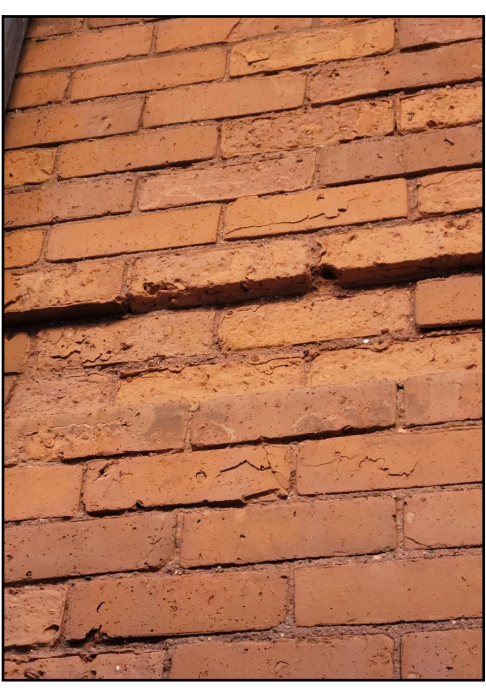
Building Knowledge CONTINUED FROM PAGE 8

Answers: 1.F 2.C 3.I 4.E 5.G 6.H 7.A 8.D 9.K 10.J 11.B 12.L 13.M