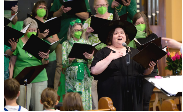
See more event photos at www.centralforgood.org/photos!