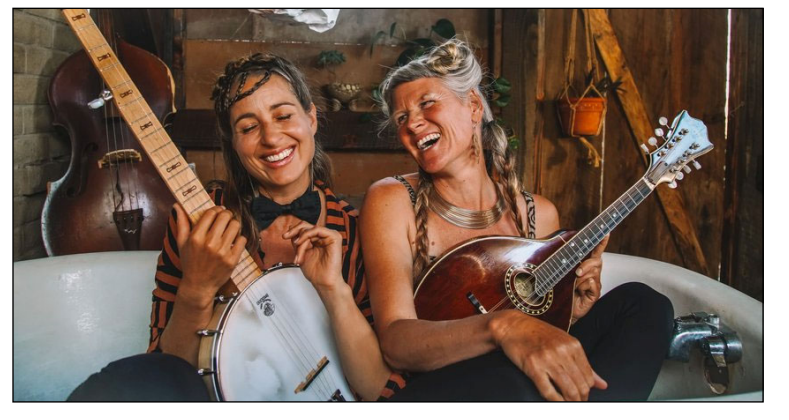
Musical Guest MaMuse (www.mamuse.org)