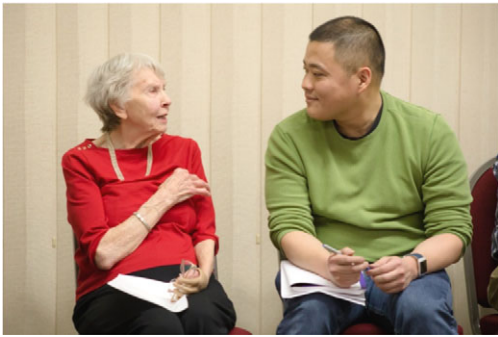
Gathering for the first time together to learn about anti-racism?