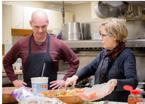
The yummy smells that emerged from the kitchen on the third Sunday?