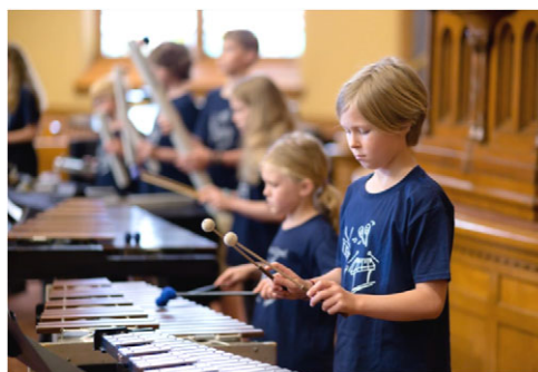
Watching our youth share new talents!