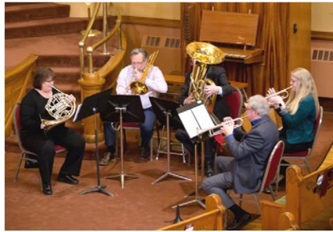
Enjoying the opportunity to hear music from our favorite guest musicians?