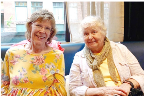
Networking with others around our city?