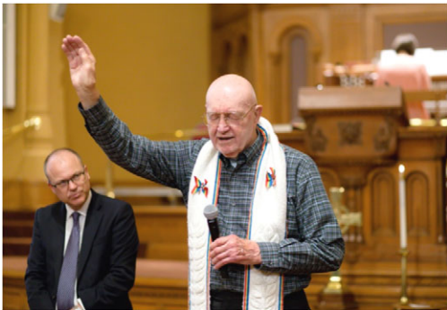
Hearing special worship messages from our Parish Associates?