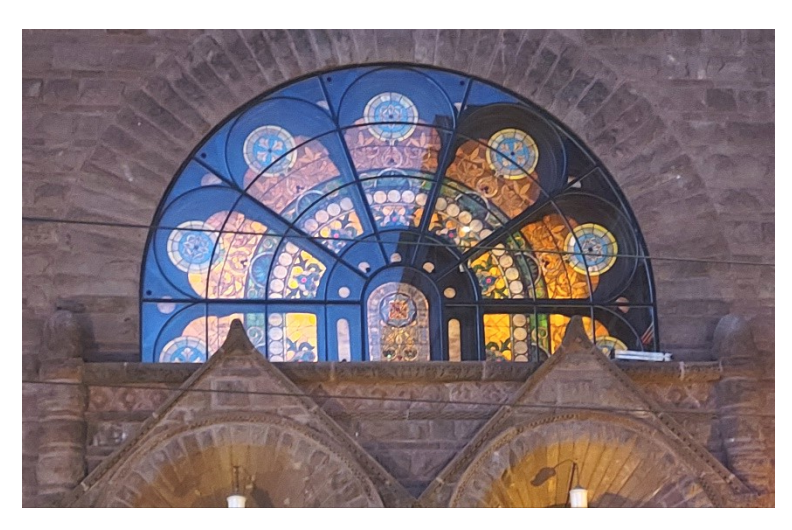
AFTER: Stained glass is visible again!