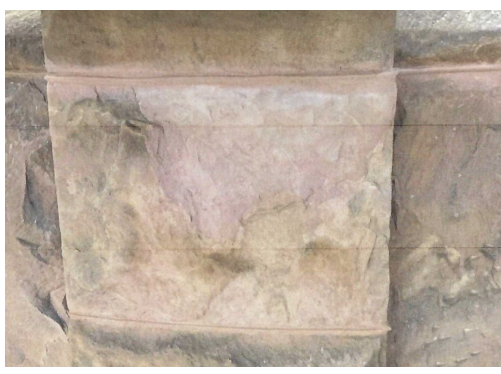
AFTER: Masons removed loose portions and patched to match stone.