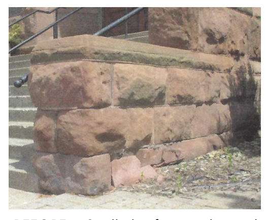
BEFORE: Spalled (fractured) and crumbling stone and mortar joints on stair wall by entry.