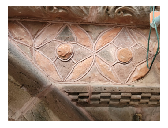
AFTER: Deteriorating patches were replaced, retaining as much of the original stone as possible.