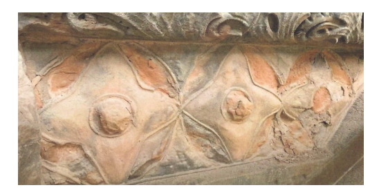
BEFORE: Previous patchwork of rosettes above main entrance were deteriorating.