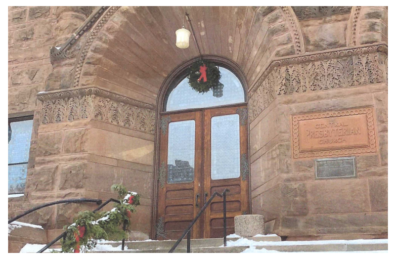
AFTER: In addition to stone repair/replacement at the entrance, the cloudy storm windows on the entrance doors and adjacent windows were replaced.