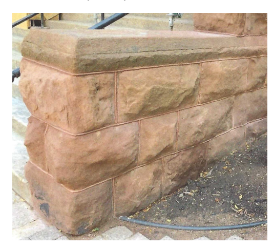
AFTER: Two stones replaced in wing wall, wing wall repointed.