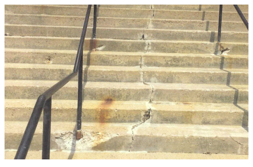
BEFORE: Cracked and crumbling concrete on steps of main entrance.