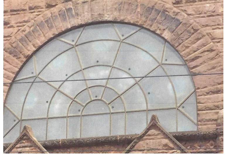
BEFORE: Storm window covers were cloudy over the stained glass window, concealing the wood frame.