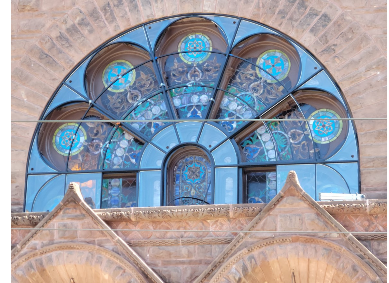
DURING: Details of the stained glass are so well seen during the replacement process.